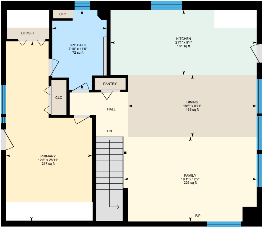
2nd Floor Exterior Area 1139.12 sq ft