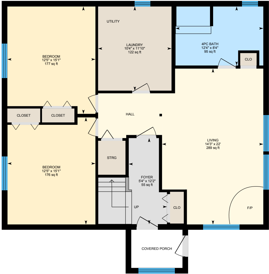
Main Floor Exterior Area 1213.22 sq ft

Main Building: Total Exterior Area Above Grade 2352.34 sq ft