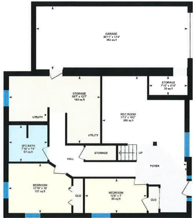
1st Floor Exterior Area 1102.81 sq ft