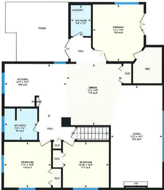
Main Floor Exterior Area 1438.91 sq ft

Main Building: Total Exterior Area Above Grade 2541,72 sq ft