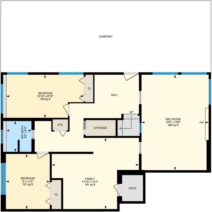
Lower Floor Exterior Area 1098.76 sq ft