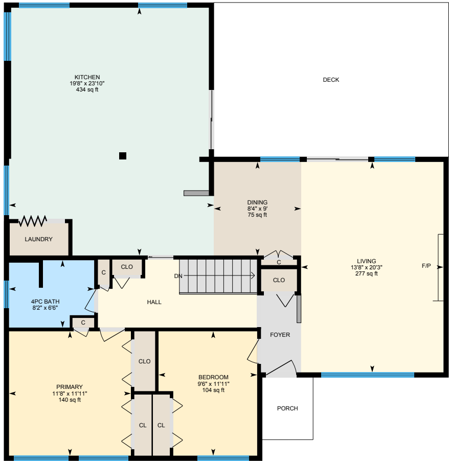
Main Floor Exterior Area 1401.25 sq ft

Main Building: Total Exterior Area 2500.01 sq ft