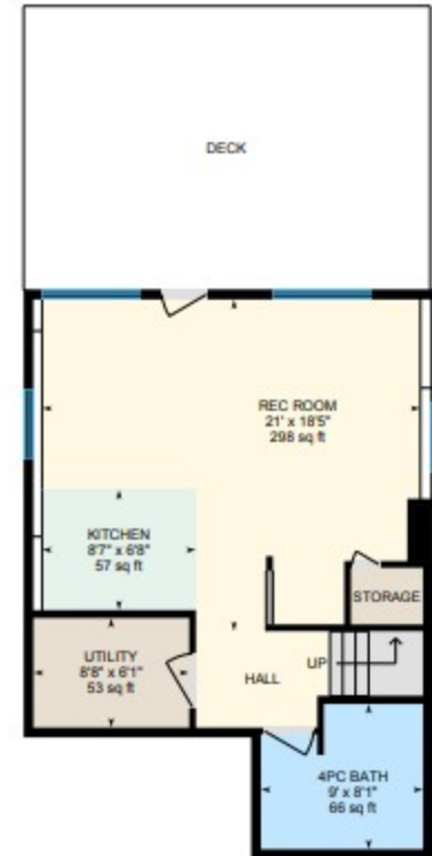
Basement (Below Grade) Exterior Area 624.23 sq ft