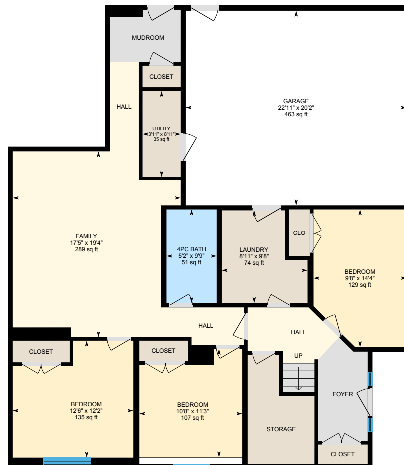
Basement (Below Grade) Exterior Area 1314.74 sq ft