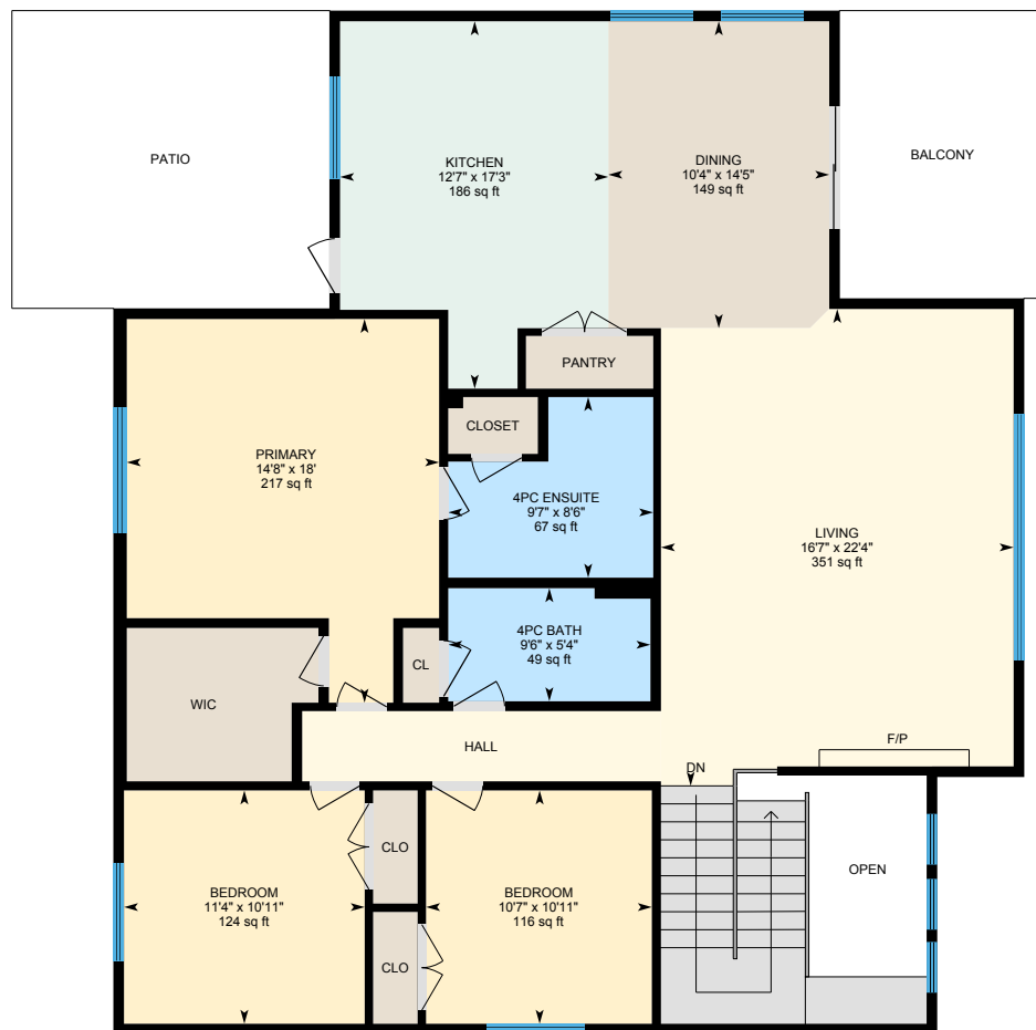
Main Floor Exterior Area 1684.49 sq ft

Main Building: Total Exterior Area Above Grade 1684.49 sq ft