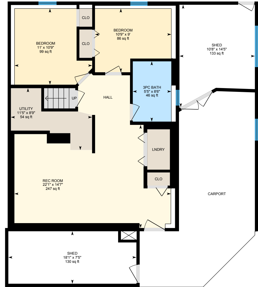
Basement Exterior Area 721.99 sq ft