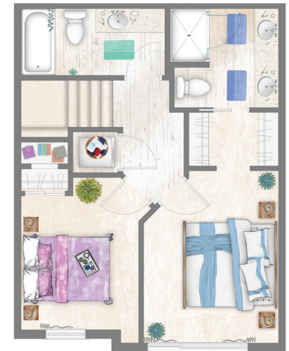
Optional Upper Floor

NOTE: All dimensions and floor plans are approximate. The floor plan shown is representative of one specific elevation and may differ in other architectural styles. Sizes and specifications are subject to change without notice. Illustrations are artists concept only. E&OE. This is not an offering for sale. An offering for sale may only be made after filing a Disclosure Statement under the Real Estate Development Marketing Act. E.&O.E.