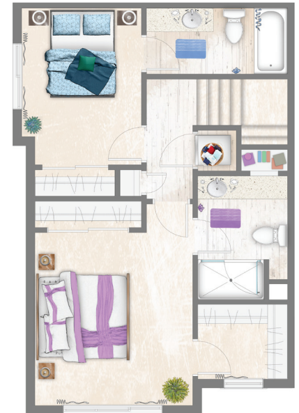
Optional Upper Floor

NOTE: All dimensions and floor plans are approximate. The floor plan shown is representative of one specific elevation and may differ in other architectural styles. Sizes and specifications are subject to change without notice. Illustrations are artists concept only. E&OE. This is not an offering for sale. An offering for sale may only be made after filing a Disclosure Statement under the Real Estate Development Marketing Act. E.&O.E.