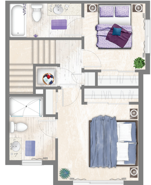
Optional Upper Floor

NOTE: All dimensions and floor plans are approximate. The floor plan shown is representative of one specific elevation and may differ in other architectural styles. Sizes and specifications are subject to change without notice. Illustrations are artists concept only. E&OE. This is not an offering for sale. An offering for sale may only be made after filing a Disclosure Statement under the Real Estate Development Marketing Act. E.&O.E.