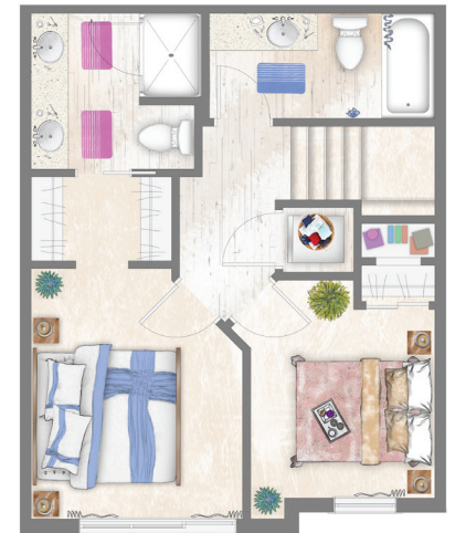
Optional Upper Floor

NOTE: All dimensions and floor plans are approximate. The floor plan shown is representative of one specific elevation and may differ in other architectural styles. Sizes and specifications are subject to change without notice. Illustrations are artists concept only. E&OE. This is not an offering for sale. An offering for sale may only be made after filing a Disclosure Statement under the Real Estate Development Marketing Act. E.&O.E.