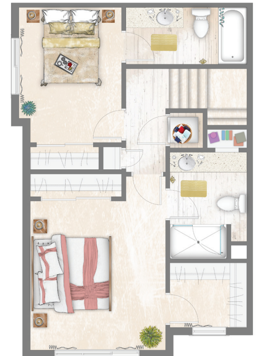
Optional Upper Floor

NOTE: All dimensions and floor plans are approximate. The floor plan shown is representative of one specific elevation and may differ in other architectural styles. Sizes and specifications are subject to change without notice. Illustrations are artists concept only. E&OE. This is not an offering for sale. An offering for sale may only be made after filing a Disclosure Statement under the Real Estate Development Marketing Act. E.&O.E.