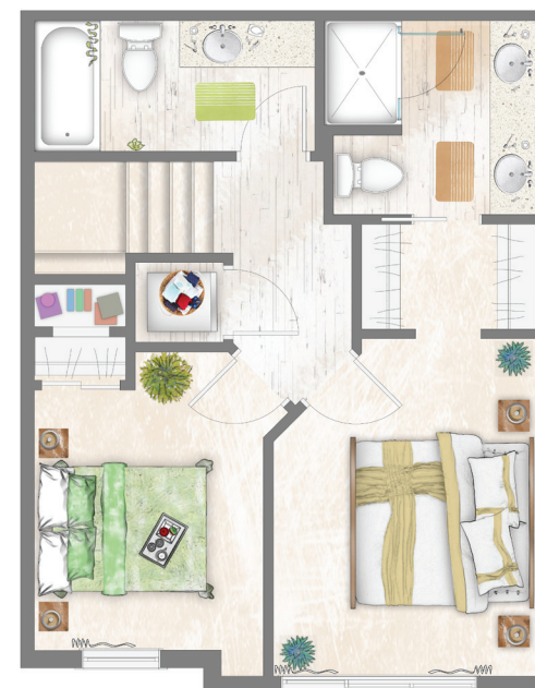
Optional Upper Floor

NOTE: All dimensions and floor plans are approximate. The floor plan shown is representative of one specific elevation and may differ in other architectural styles. Sizes and specifications are subject to change without notice. Illustrations are artists concept only. E&OE. This is not an offering for sale. An offering for sale may only be made after filing a Disclosure Statement under the Real Estate Development Marketing Act. E.&O.E.