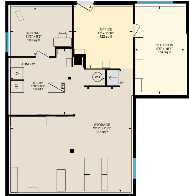
Basement (Below Grade) Exterior Area 1043.55 sq ft