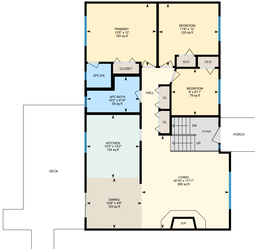
Main Floor Exterior Area 1190.35 sq ft

Main Building: Total Exterior Area 2084.32 sq ft