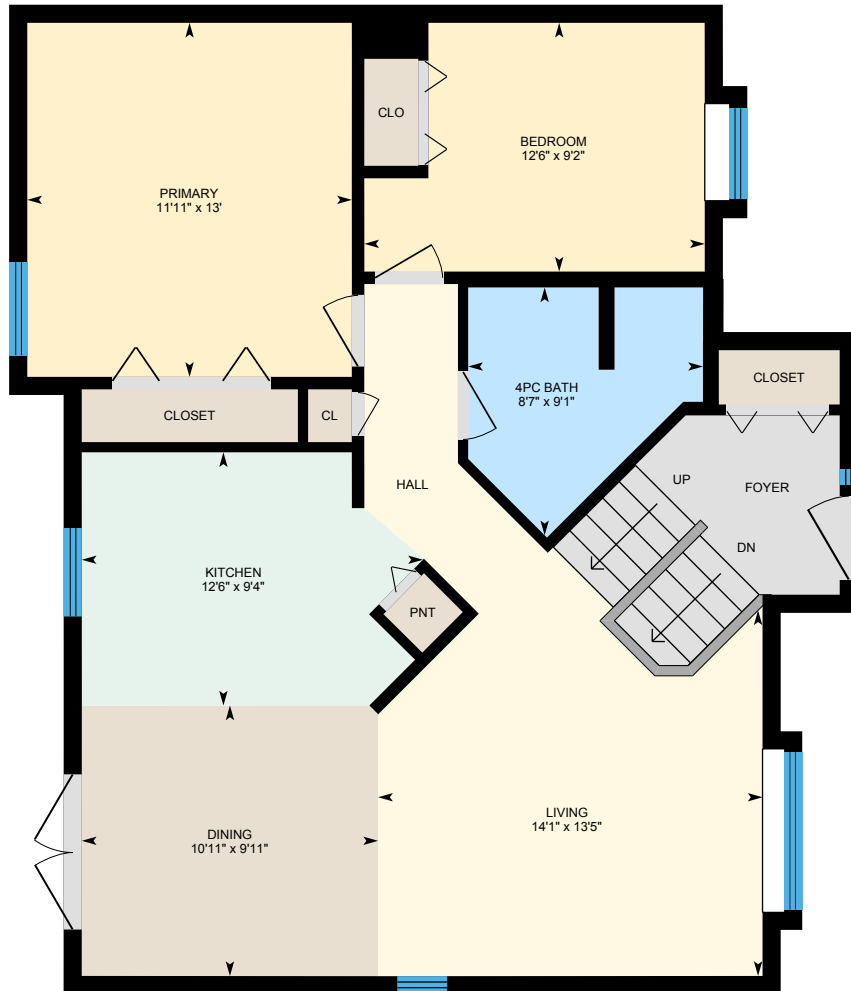
Main Floor Exterior Area 989.49 sq ft

Main Building: Total Exterior Area Above Grade 989.49 sq ft