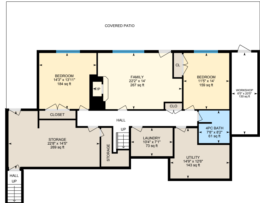
Basement (Below Grade) Exterior Area 1443.62 sq ft