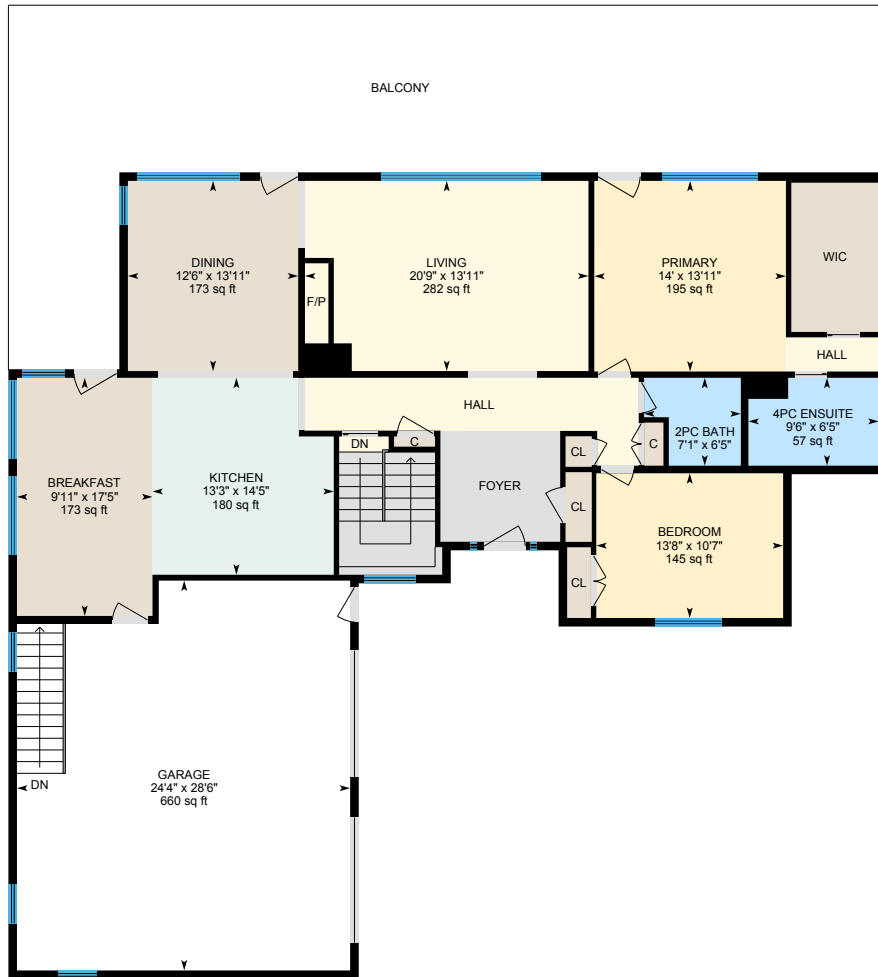
Main Floor Exterior Area 1824.55 sq ft

Main Building: Total Exterior Area Above Grade 1824.55 sq ft