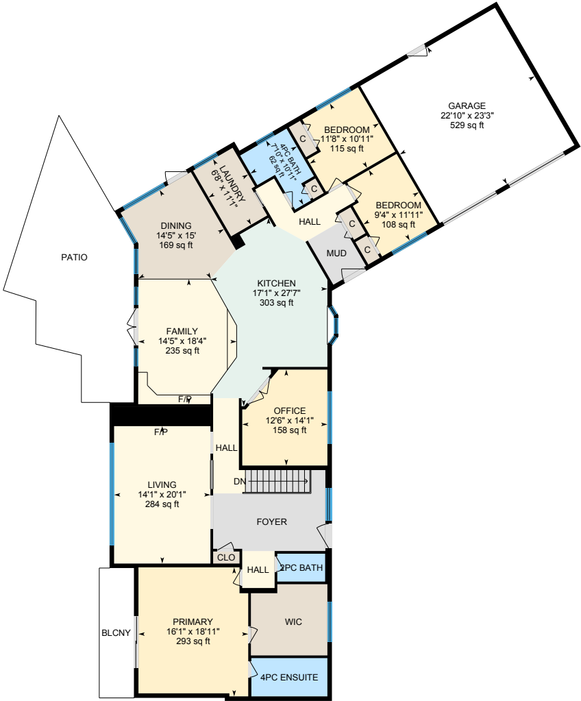
1st Floor Exterior Area 2717.15 sq ft

Main Building: Total Exterior Area Above Grade 2717.15 sq ft