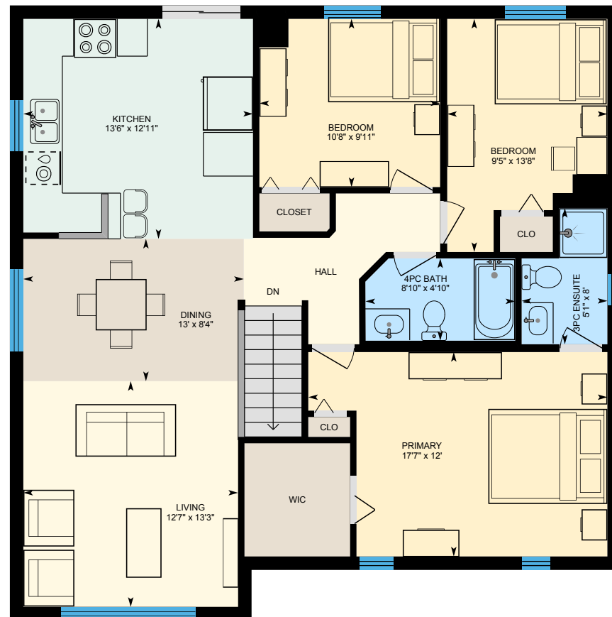
2nd Floor Exterior Area 1232.59 sq ft