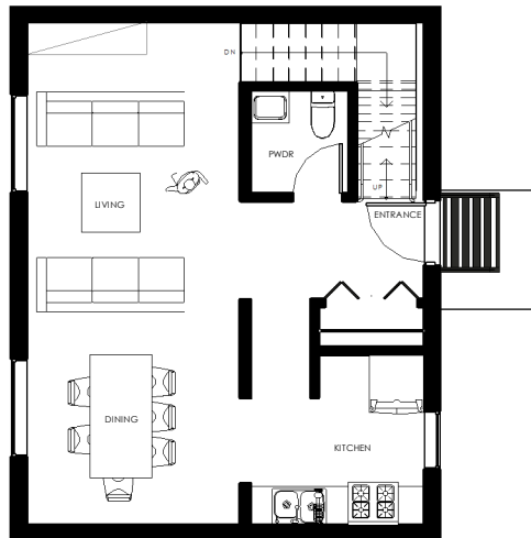
second floor: 563 SQFT