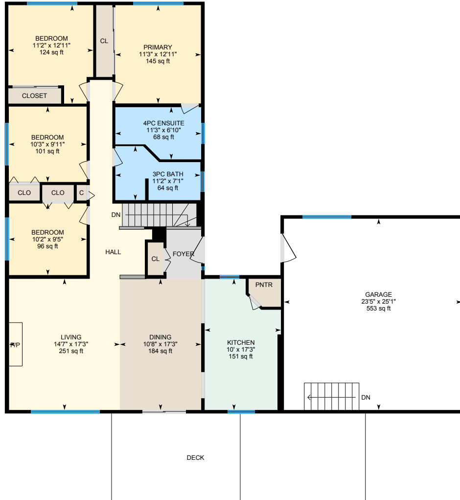
Main Floor Exterior Area 1611.57 sq ft

Main Building: Total Exterior Area 3082.12 sq ft