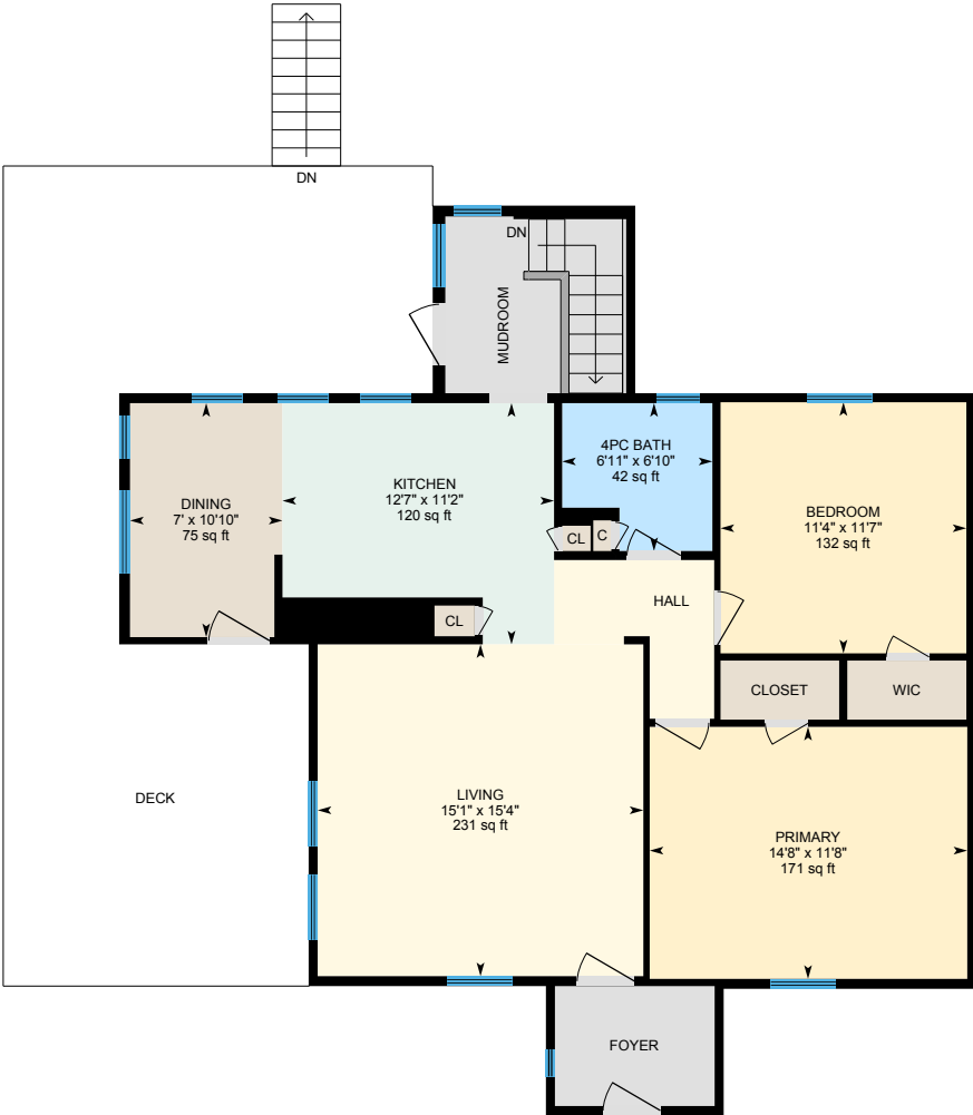
Main Floor Exterior Area 1072.25 sq ft

Main Building: Total Exterior Area Above Grade 1072.25 sq ft