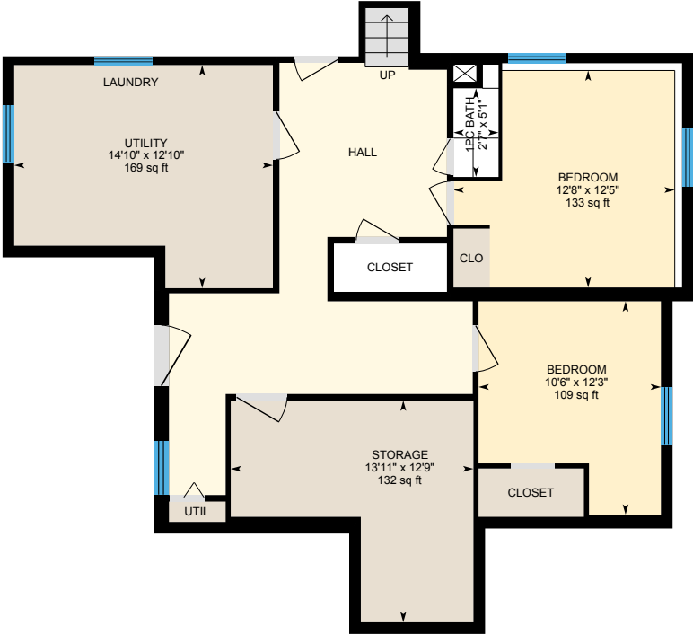
Basement (Below Grade) Exterior Area 941.68 sq ft