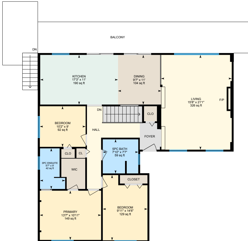
1st Floor Exterior Area 1431.85 sq ft

Main Building: Total Exterior Area Above Grade 1431.85 sq ft