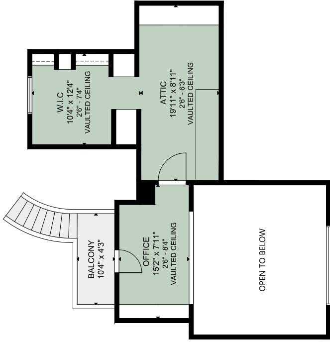
UPPER FLOOR 480 SQ. FT.