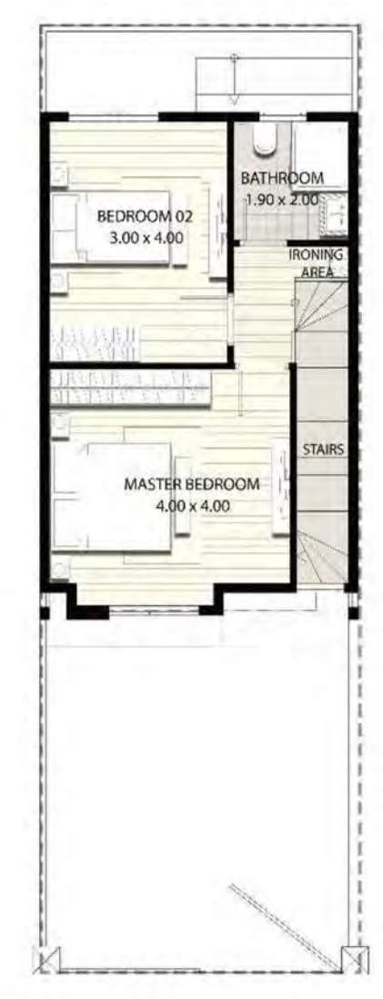
2 Bedroom Terrace