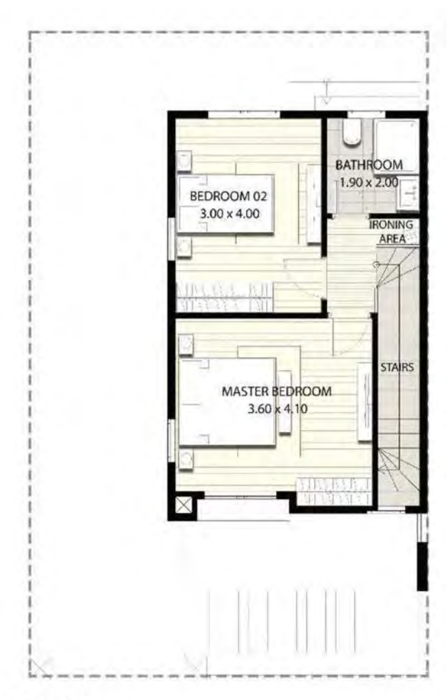
2 Bedroom Duplex