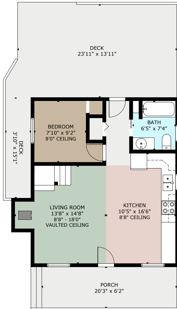
MAIN FLOOR 577 SQ. FT.