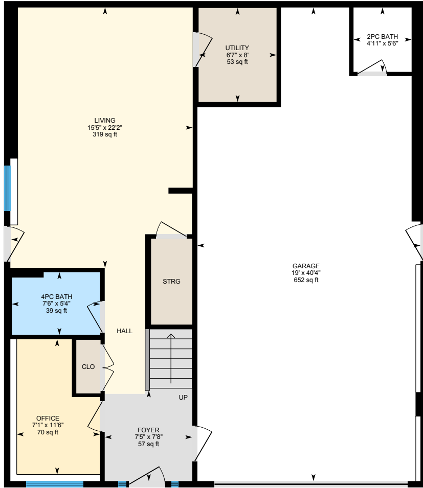
1st Floor Exterior Area 719.84 sq ft

Main Building: Total Exterior Area Above Grade 2260.95 sq ft