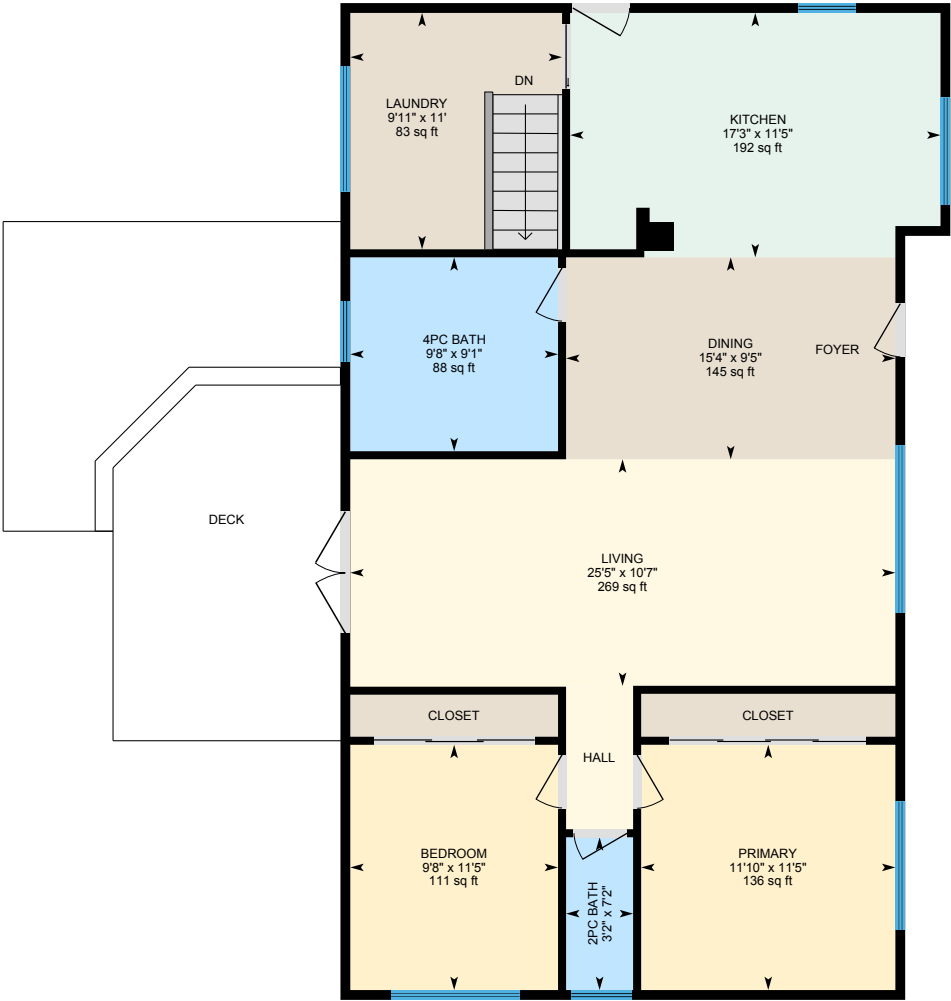
1st Floor Exterior Area 1246.45 sq ft

Main Building: Total Exterior Area Above Grade 1246.45 sq ft