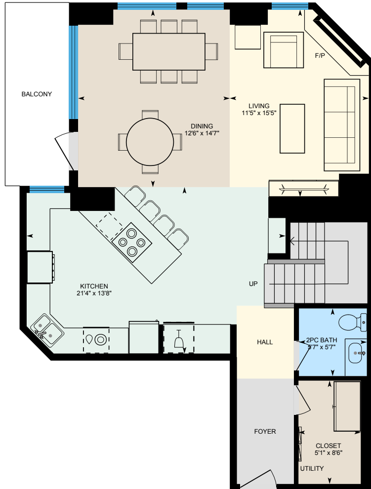
Main Floor Interior Area 827.98 sq ft

Main Building: Total Interior Area Above Grade 1663.91 sq ft