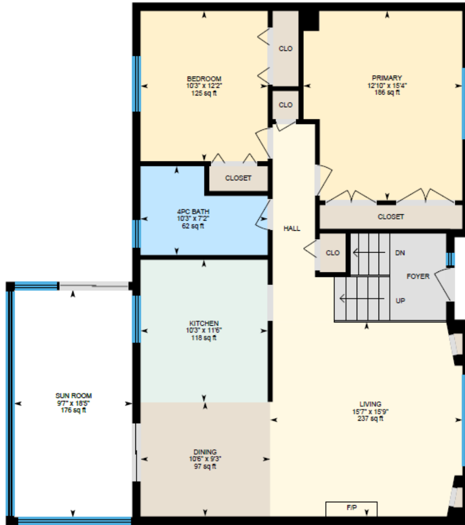
Main Floor Exterior Area 1172.20 sq ft

Main Building: Total Exterior Area Above Grade 1172.20 sq ft