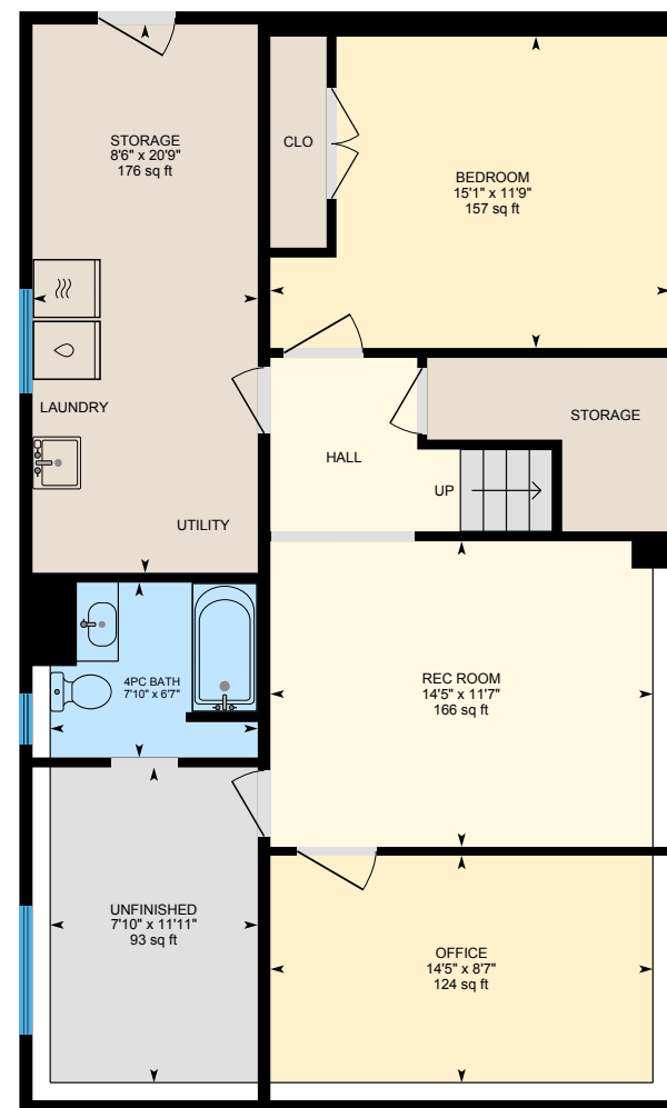
Basement (Below Grade) Exterior Area 997.82 sq ft