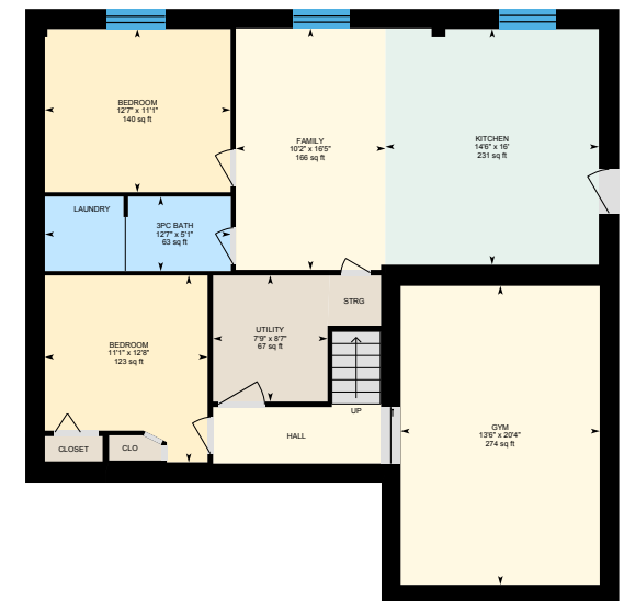
Lower Level (Below Grade)